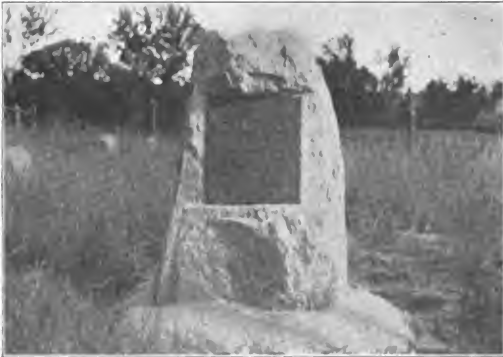
MONUMENT TO UNION PACIFIC TRACK LABORERS.

The Kansas boys who served in the Spanish-American war and in the Philippines have not been neglected in the erection of appropriate memorials. A tablet has been placed in the Miami county court-house at Paola and dedicated to the soldiers from that county who served in the war. At Ottawa a memorial gateway at Forest park has been erected at a cost of $2,000 "In honor of Company K, Twentieth Kansas regiment, in appreciation of their gallantry and patriotism in the Philippine islands, 1898-99." In the chapel of the University of Kansas is a